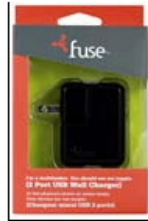
Model / Modèle 6776