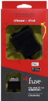
Model / Modèle 6225