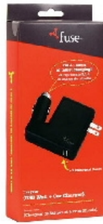
Model / Modèle 7206