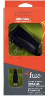
Model / Modèle 6788