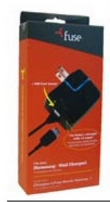
Model / Modèle 7215