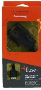
Model / Modèle 6786