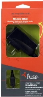
Model / Modèle 6789