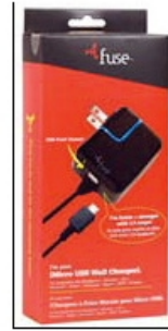
Model / Modèle 7212